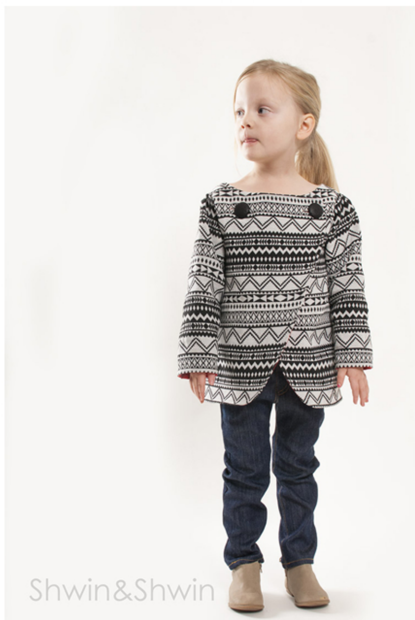
Lucy Tunic Long Sleeve Pattern Add On Pattern and add on by Shwin Designs http://shwindesigns.bigcartel.com/product/lucy-tunic-size-12m-6y