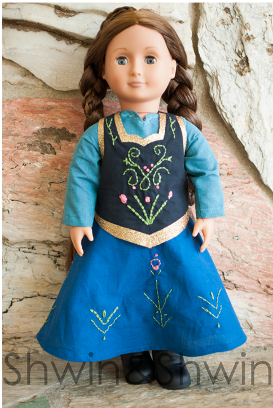
“Anna” Inspired Doll Dress By Shwin&Shwin Print at 100%