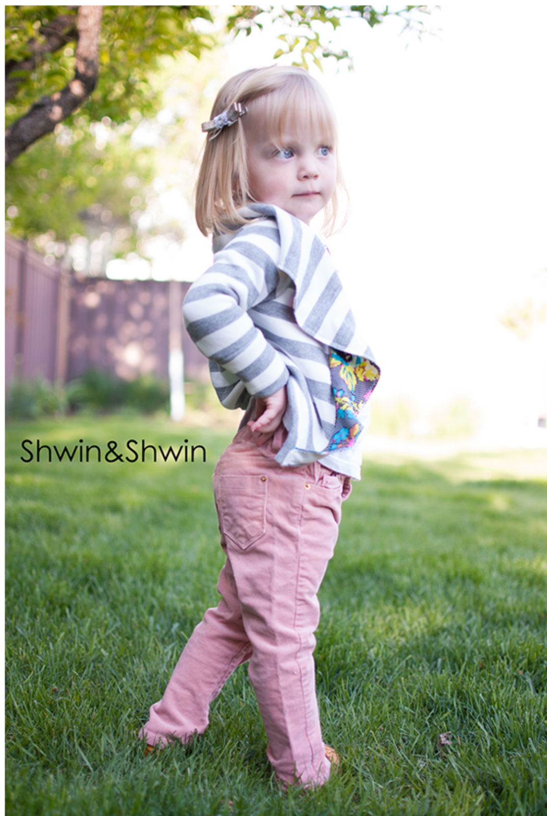
Circle Cardigan Pattern Print at 100% No scale. Pattern by Shwin&Shwin